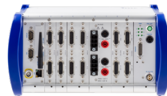
imc CRONOScompact portable housing